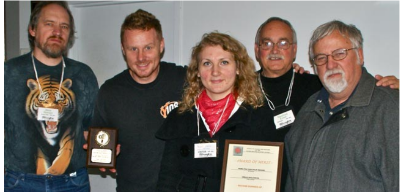
The "Liquid Ice" group accept their awards from the SCCA contest.